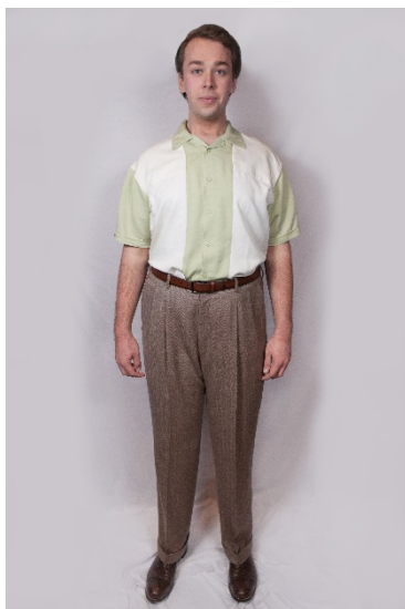
Coro Man Act 1