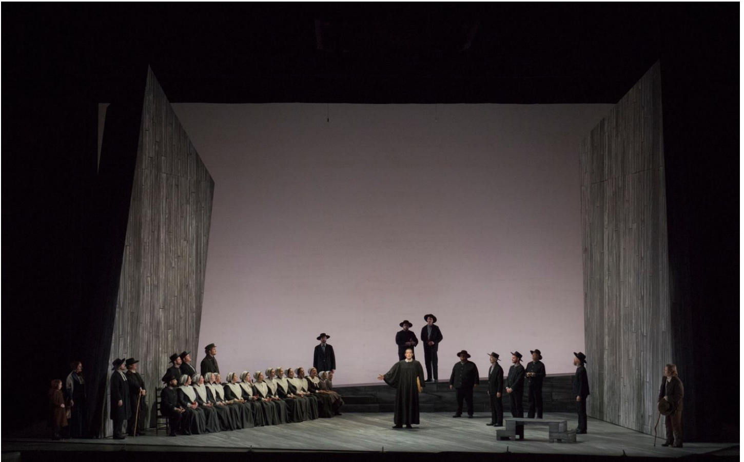
Act 2, Scene 2 – A Meeting Place – Death of Dimmesdale