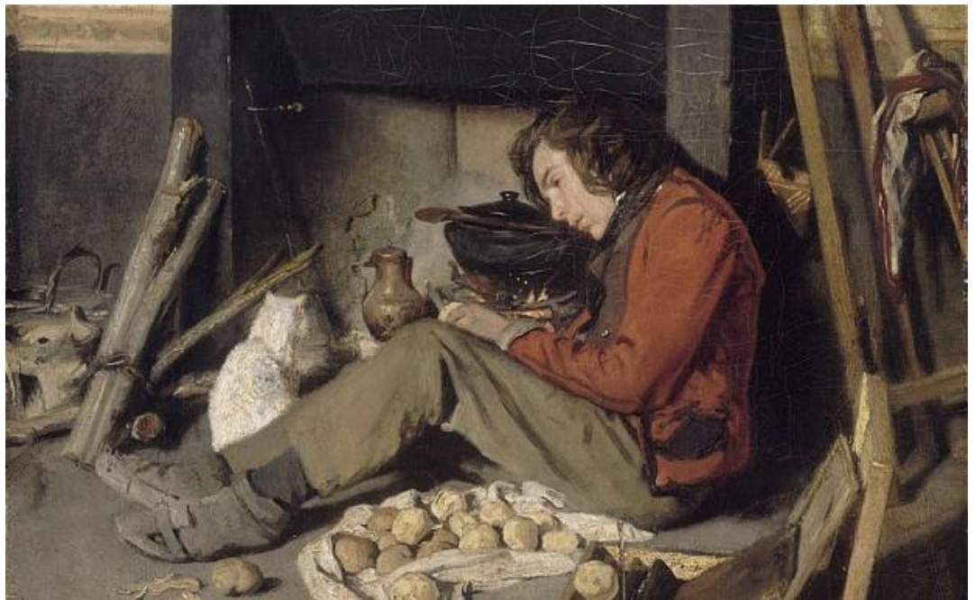
Oil on canvas by Octave Tassaert (1845)