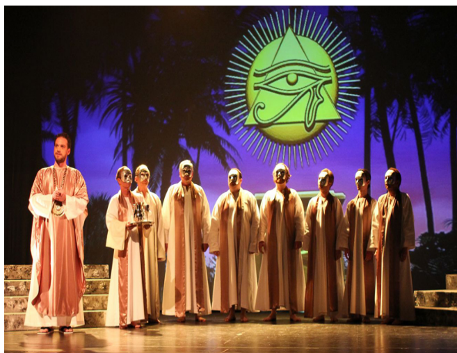
Boheme Opera, NJ

Of particular interest to us is the role of Freemasonry in the founding of the United States of America. The great majority of the signers of the Declaration of Independence were Masons, as were most of the generals in the Revolution. Except for the two Adamses, all of our Presidents through