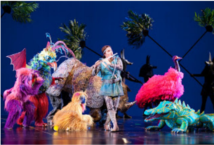
Seattle Opera seattleoperablog.com

Since the dawn of history, comic or popular theatre has existed alongside serious or tragic theatre. In primitive societies and in modern ones as well, comedy was commonly used as an invaluable way to get at truth. For example, in ancient Greece, satyr plays, those involving humor and improvisation, were as popular as the tragedies. Medieval morality plays featured a moral lesson and a goodly dose of clowning. In England, it was the genius of Shakespeare that managed to bring together these two elements in a single play—not once but again and again, in one masterpiece after another.