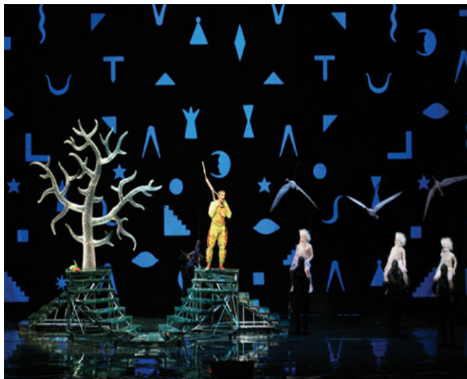
Papageno Suicide, Magic Flute

have together (Duet: "Pa ... pa ... pa ...").