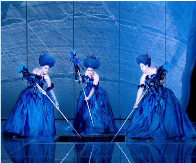
Nicholas Hytner's Magic Flute Independent.co.uk

Tamino, a handsome prince who is lost in a distant land, is being pursued by a serpent and asks the gods to save him (quartet: "Zu Hilfe! Zu Hilfe!"). He faints, and three ladies, attendants of the Queen of the Night, appear and kill the serpent. They admire Tamino for his handsomeness and youth. Each of the ladies tries to convince the other two to leave to tell their mistress about the young prince. After