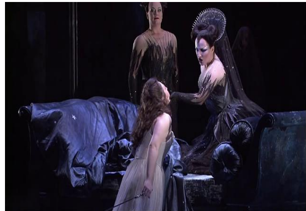
The Royal Opera House, Magic Flute

Pamina is asleep. Monostatos approaches and gazes upon her with rapture. (Aria: "Alles fühlt der Liebe Freuden") He is about to kiss the sleeping Pamina, when the Queen of the Night appears. Pamina wakes and tells her mother that Tamino is aspiring to join Sarastro's brotherhood and to gain enlightenment. The Queen is furious and reveals her true plan: she gives Pamina a dagger, ordering her to kill Sarastro with it and threatening to disown her if she does not. (Aria: "Der Hölle Rache kocht in meinem Herzen" / "Hell's vengeance boils in my heart"). She leaves, and Pamina declares that she will not do as her mother asked. Monostatos returns and tries to force Pamina's love by