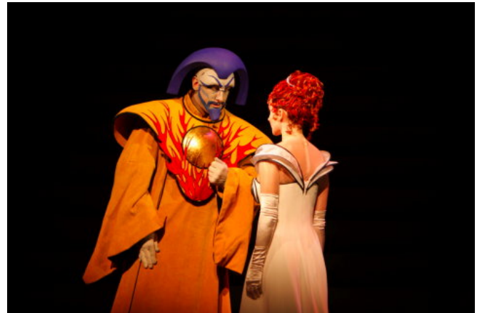
LA Opera, Magic Flute

Pamina, her hands bound, is brought in by Sarastro's slaves. Monostatos gloats that she is in his power. He orders the slaves to untie her and leave them together. Papageno, sent ahead by Tamino to help find Pamina, enters. (Trio: "Du feines Täubchen, nur herein!".) Monostatos and Papageno are each terrified by the other's strange appearance and Monostatos flees. Papageno