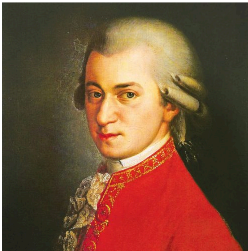
Mozart Portrait

The composer we know as Wolfgang Amadeus Mozart was born in Salzburg, as Johann Chrysostomus Wolfgangus Theophilus Amadeus Gottlieb Mozart . His parents were Anna Maria and Leopold, a musician and Leopold realized that he could make money by showing off his son in the courts of Europe. Mozart soon became known as a musical prodigy (someone who is extremely talented at something at a very young age,) and was known for being