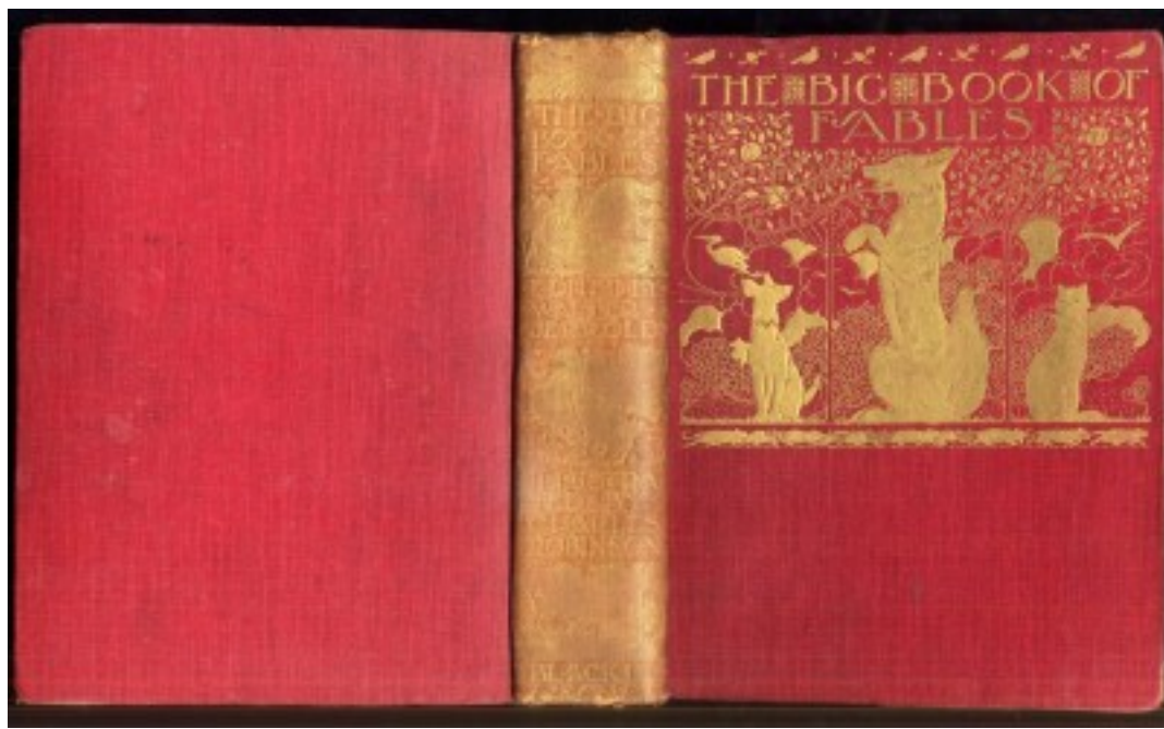
The Big Book of Fables pazzobooks.com