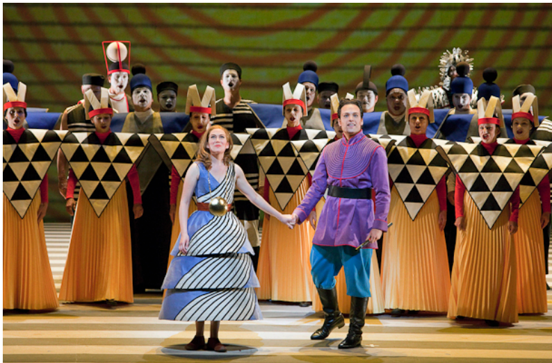
San Francisco Opera, Magic Flute

The priests celebrate Tamino's successes so far, and pray that he will succeed and become worthy of their order (Chorus: "O Isis und Osiris"). Pamina is brought in and Sarastro instructs Pamina and Tamino to bid each other farewell before the greater trials ahead. (Trio: Sarastro, Pamina, Tamino - "Soll ich dich, Teurer, nicht mehr sehn?") They exit and Papageno enters, in search of Tamino and complaining about the trials. The priests grant his request for a glass of wine and he expresses his desire for a wife. (Aria, Papageno: "Ein Mädchen oder Weibchen"). The elderly woman reappears and tells him that unless he marries her, he will be imprisoned forever. When Papageno promises to love her faithfully (muttering that he will only do this until something better comes along), she immediately transforms into the young and pretty Papagena. Papageno rushes to embrace her, but the priests drive him back, telling him that he is not yet worthy of her.