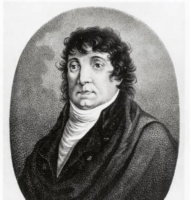
Schikaneder Portrait aeiou.at

The series of fairy-tale operas culminated in the September 1791 premiere of the " Die Zauberflöte ", with music by Mozart. The libretto was Schikaneder's and incorporated a loose mixture of Masonic elements and traditional fairy-tale themes. Schikaneder took the role of Papageno--a character reflecting the Hanswurst tradition, and thus suited to his skills--at