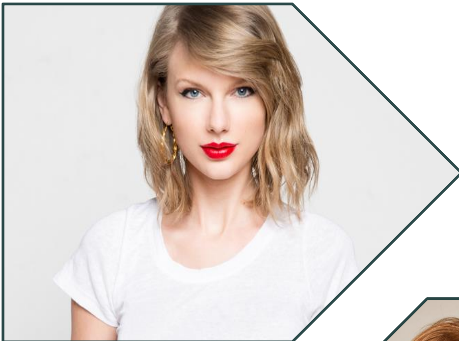
EXAMPLE #1: "Dear John" by Taylor Swift

While the opera is more rich and varied than it is often given credit for, it is still a distinct musical form. As you've probably guessed, opera and pop music are genres with many differences! Singers such as Renee Fleming, Denyce Graves, and Joan Sutherland are much different than pop singers such as Bruno Mars and Taylor Swift. In this activity, we will listen to different examples of famous opera excerpts and famous pop songs. Can you spot the differences?