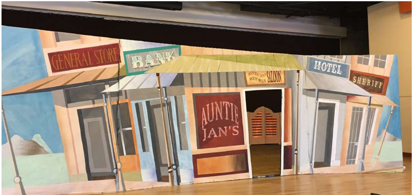
PHOTO | The open sets for Opera Colorado's touring production of The Elixir of Love .

Some operas are viewed as concept operas ; stories that can happen in any setting or time. In opera, the music and narrative remain the same while the set, costumes, wigs, makeup, and period of the production will change in order to show audiences an opera they may have seen before, in a new way. For example, The Elixir of Love was written to be set in Bergamo, Italy in the early 19th century and is intended to be sung in Italian. Opera Colorado has adapted the story and set it to the old America West, specifically Colorado, in the late 1800s, and changed the language to English so that you may better understand the lyrics. However, despite these changes, the story remains as Donizetti intended.