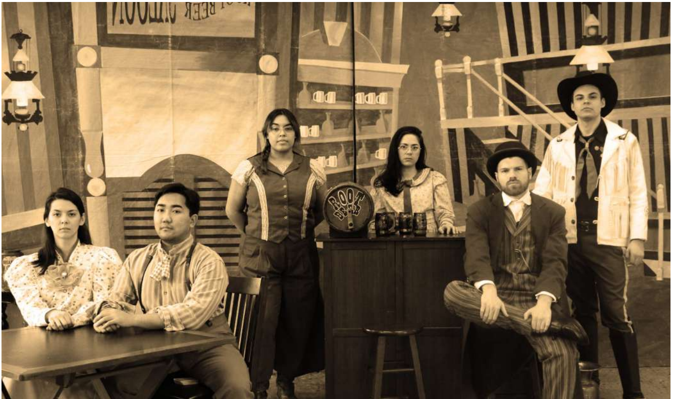
PHOTO | The 2023-24 Artists in Residence in their performance of The Elixir of Love .

Donizetti had a brief stint in Paris, debuting Marino Faliero in 1835 and concluded with Dom Sebastien in 1843. He then traveled to Austria and became director of the imperial theaters. His final works premiered at the Karntnertortheater venue in Vienna. After Linda di Chamounix (1842) became a success, he was appointed Composer to the Austrian Court, a valued position that only 50 years prior had been held by Mozart. But soon after, by 1845, his disease took over, causing paralysis, erratic behavior, and disorientation. He was cared for by family and relocated back to Bergamo, his city of birth, where he passed at the age of 49. Over a span of twenty-five years, Donizetti produced over seventy operas and helped establish the artform in Italy. His operas are still globally enjoyed by audiences today.