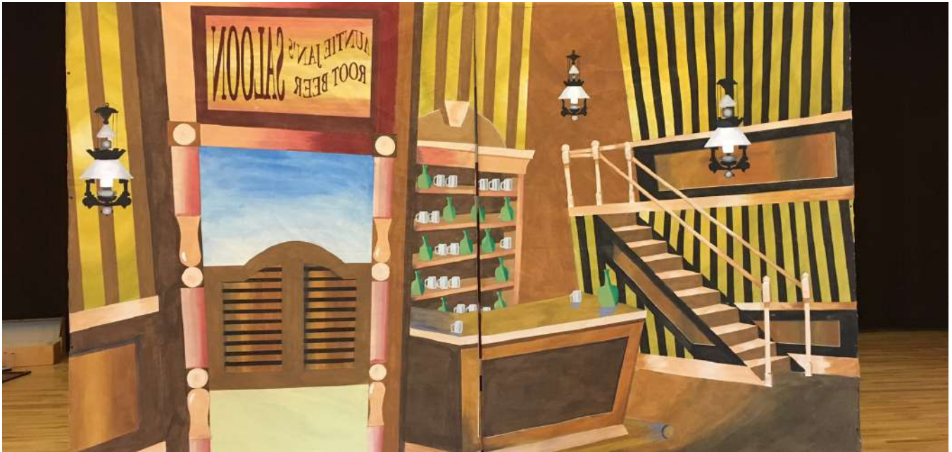
PHOTO | Auntie Jan's Root Beer Saloon set for Opera Colorado's touring production of The Elixir of Love .